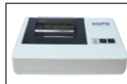
Portable Micro Printer

Can perform test result transfer to computer in excel format and touch screen also can collect data by using pen drive