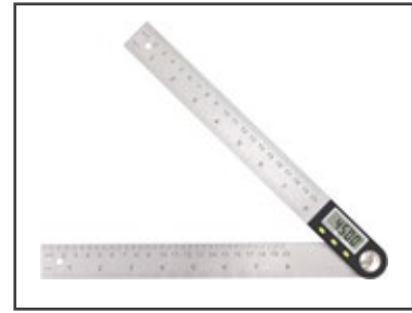
Digital Angle Ruler