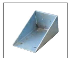
NL 5006 X / 003 – P 003A