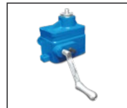
NL 5006 X / 003 – A003