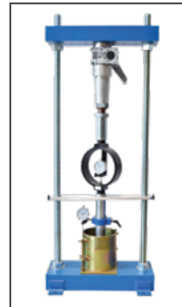
Lab test Set Up