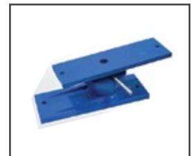
NL 5006 X / 002 – A004